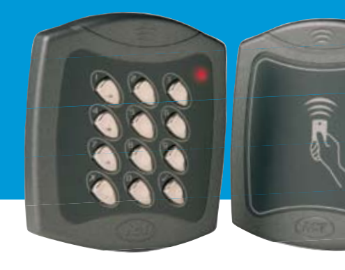
ACT smart2 1080/1090